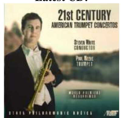
21<sup>st</sup> Century American Trumpet Concertos-2014 Albany Records Label