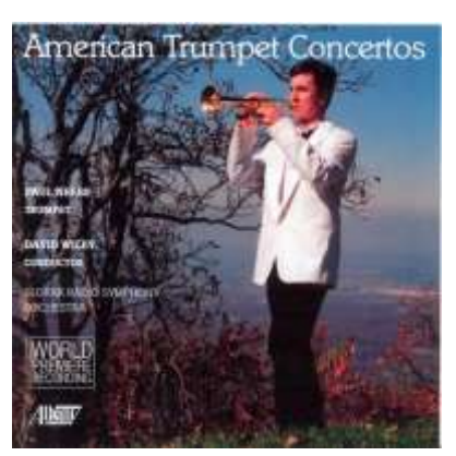
American Trumpet Concertos- 2006 Albany Records Label